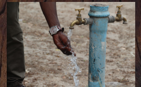
FRESH CLEAN WATER