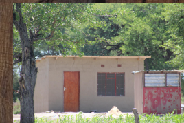
OLD AGE HOUSING

WE HAVE DIFFERENT PROJECTS IN ALL SETTLEMENTS